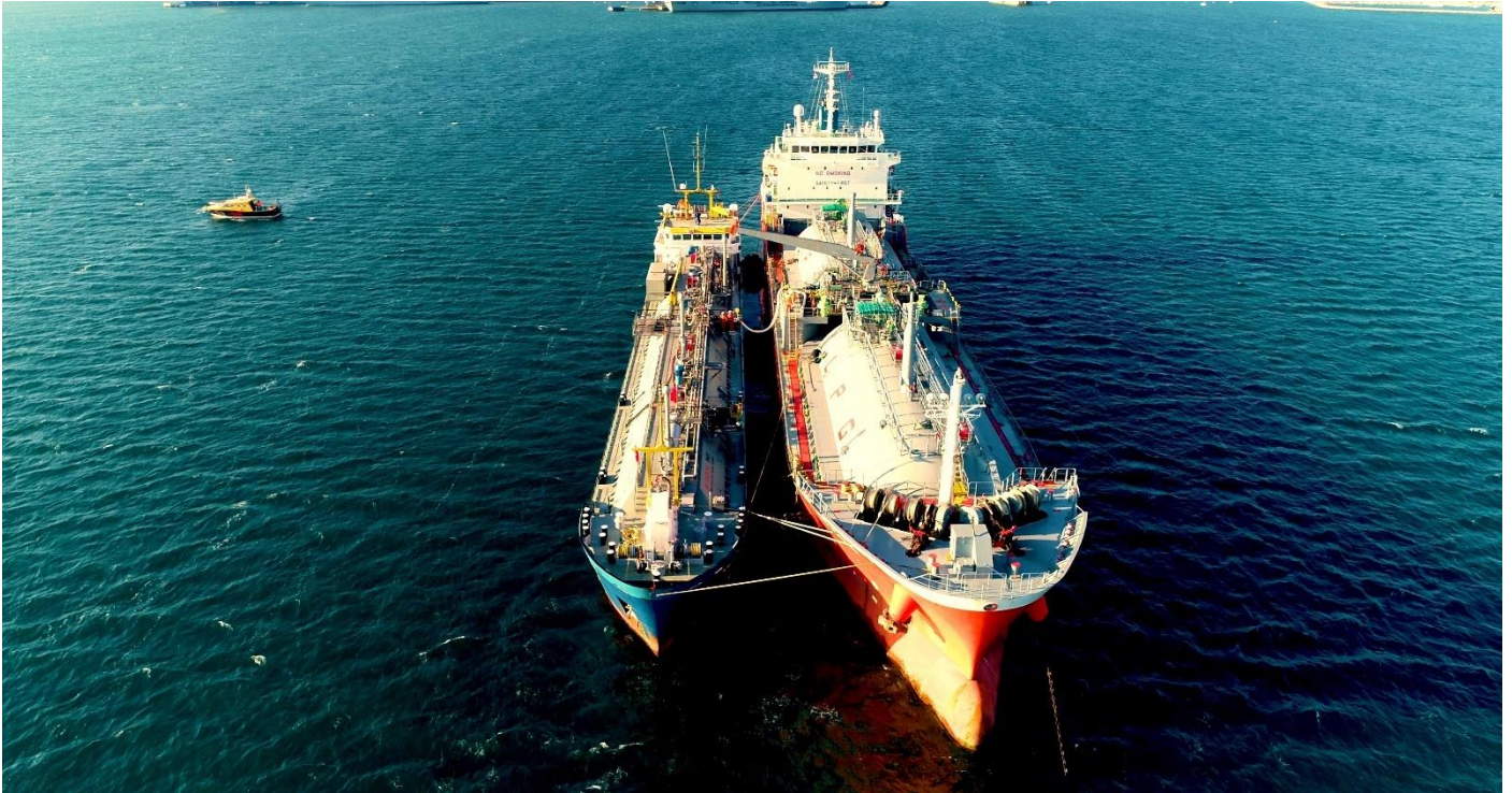
PICTURE: The Epic Madeira and Tempest carrying out an STS operation in Portland Harbour

In February of this year, the Portland Port group announced that it was set up and ready to provide ship to ship (STS) operations. On Thursday 29 th April 2021, the Portland Port group in direct cooperation with STS Marine Solutions Ltd commissioned the port's first STS operation.